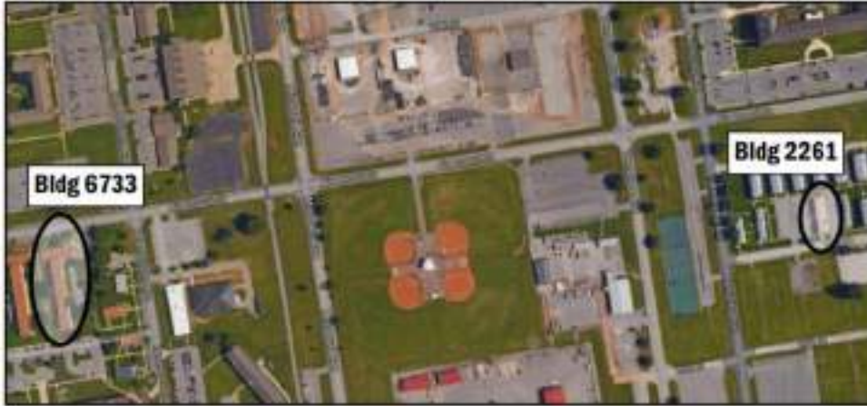
Figure 2. Fort Campbell cantonment area showing demonstration locations.

The Two-step novel dry fog process used exclusively by Pure Maintenance was applied in two buildings at Fort Campbell, KY Army Base in 2017.